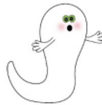
I Scream (Ice Cream)