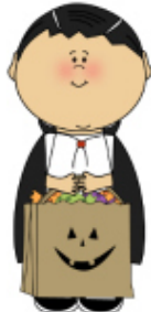
Because he had bat breath!

What do you call a witch who lives at the beach?